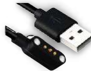
Smart mag charge